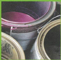
PAINT & SOLVENTS