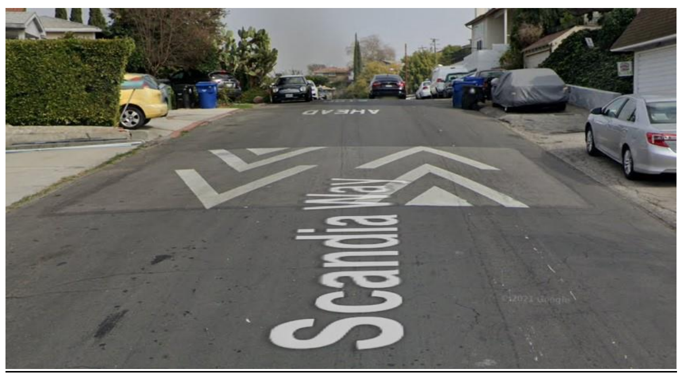
Scandia Wy (Los Angeles)