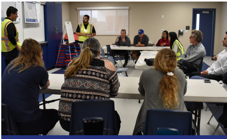
Debrief session with parents after the walk