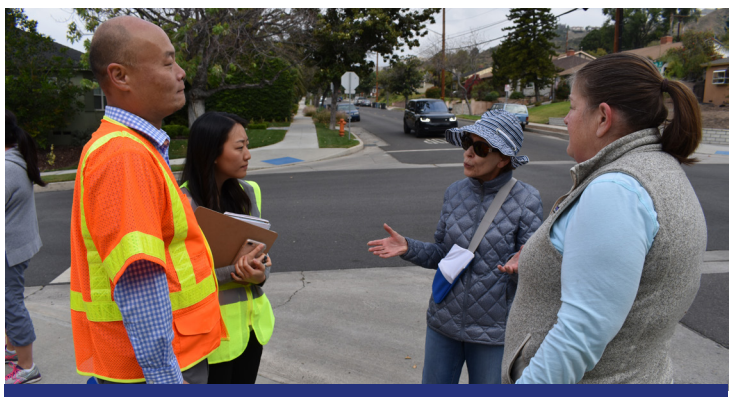
Discussing pedestrian issues on the walk with parents