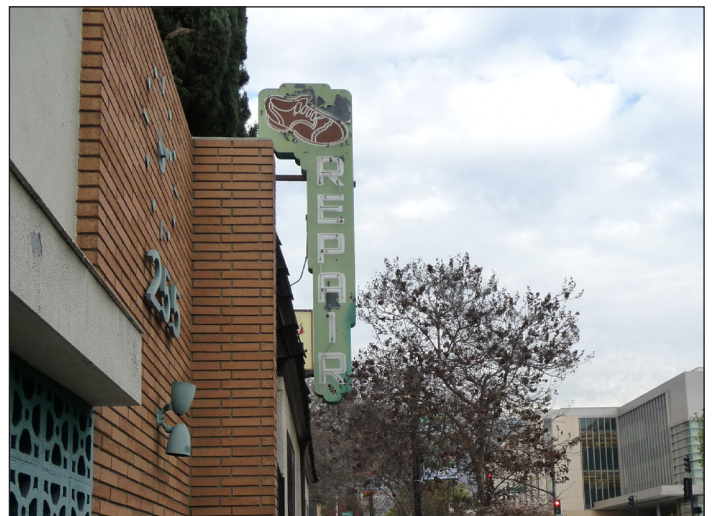
265 E. Orange Grove Ave.