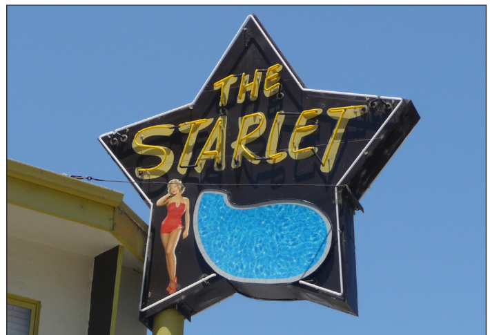
4100 Warner Blvd.