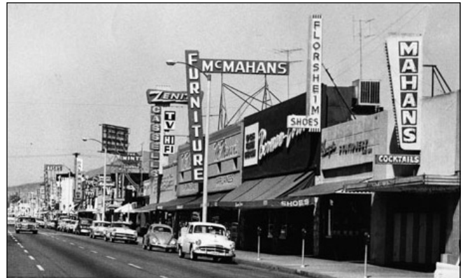
Figure 1. Burbank shopping district (San Fernando Road), 1960.

Upon completion of fieldwork, the team then researched the signs' dates of construction using City Geographic Information System (GIS) data, information