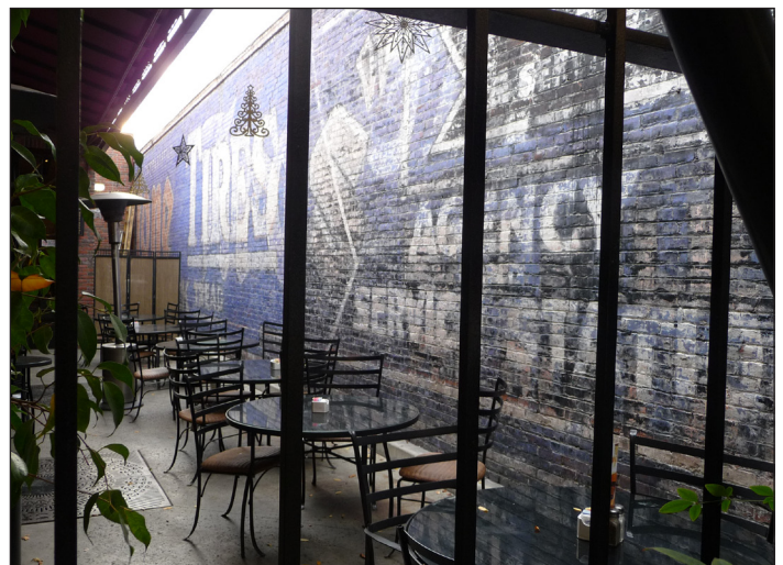
129 S. San Fernando Blvd.