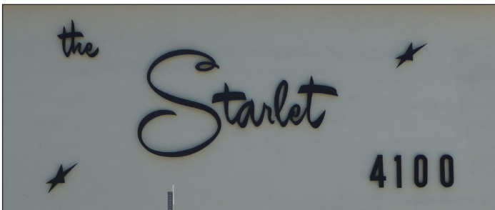
4100 Warner Blvd.

A wall mounted or façade sign represents a named multi-family residential building and is mounted to the walls (front façade or side) of a building anywhere from grade to top of parapet. It may be partially or wholly mounted on a canopy integral to a building. Signs may vary in scale and be oriented to foot traffic as well as street traffic, employing advertising strategies to declare pride of ownership and capture the attention of moving audiences. Wall mounted or façade signs are significant for their association with the residential development during the postwar period. The city saw steady growth at this time due to the influx of returning veterans, a general westward population migration, and a robust economy based on the aircraft manufacturing and motion picture industries. Burbank's residential and commercial areas became more densely developed during the postwar period, resulting in the placement of some apartment buildings along commercial corridors.