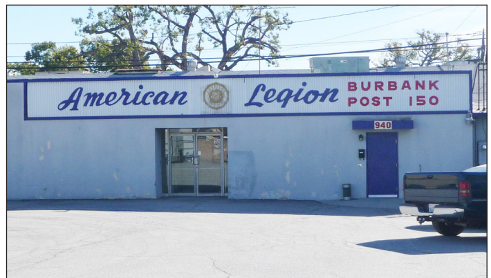
940 W. Olive Ave.