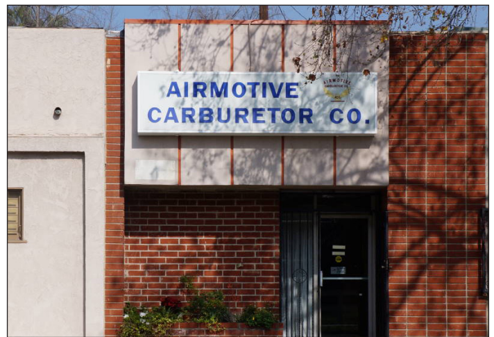
479 Riverside Dr.