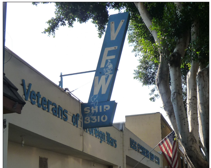
1006 W. Magnolia Blvd.