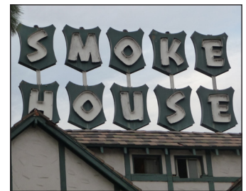
4420 Lakeside Dr.