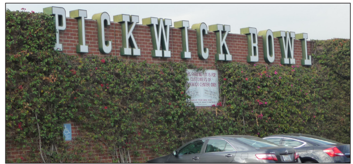
921 Riverside Dr.