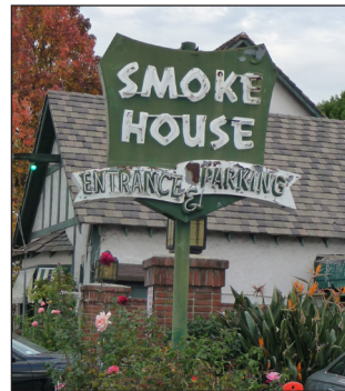
4420 Lakeside Dr.