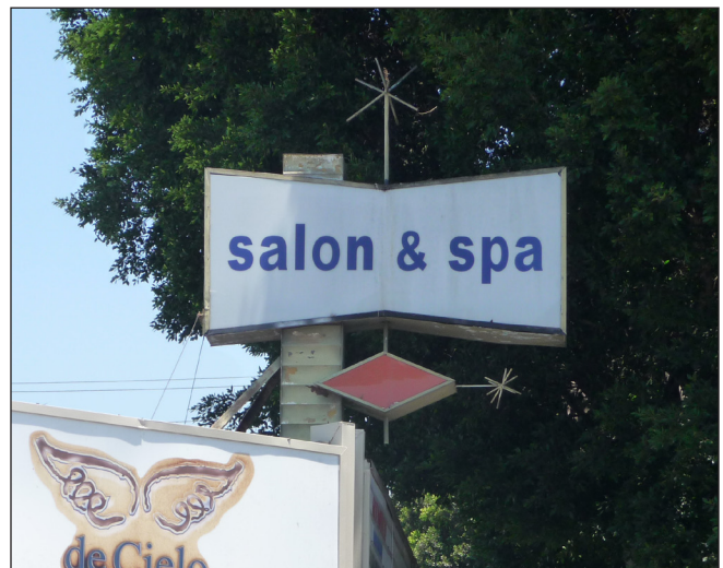
Figure 5. Example of a "Tier 2" sign, located at 921 West Magnolia Boulevard. The overall form of this sign is intact, but the internally-illuminated plastic box has been modified (ARG, 2013)