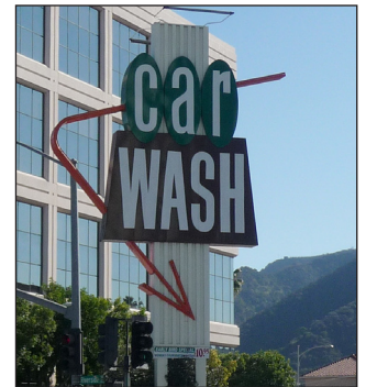
3700 Riverside Dr.