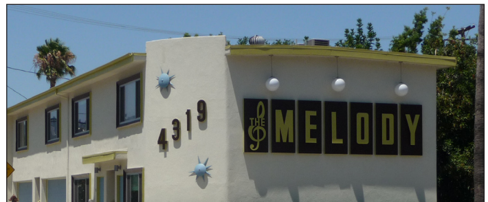
4319 W. Olive Ave.