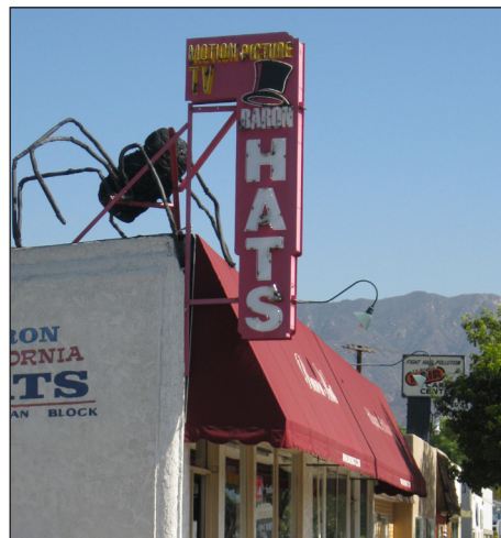
1619 Burbank Blvd.