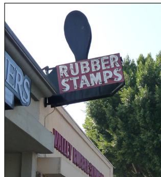
1208 W. Magnolia Blvd.