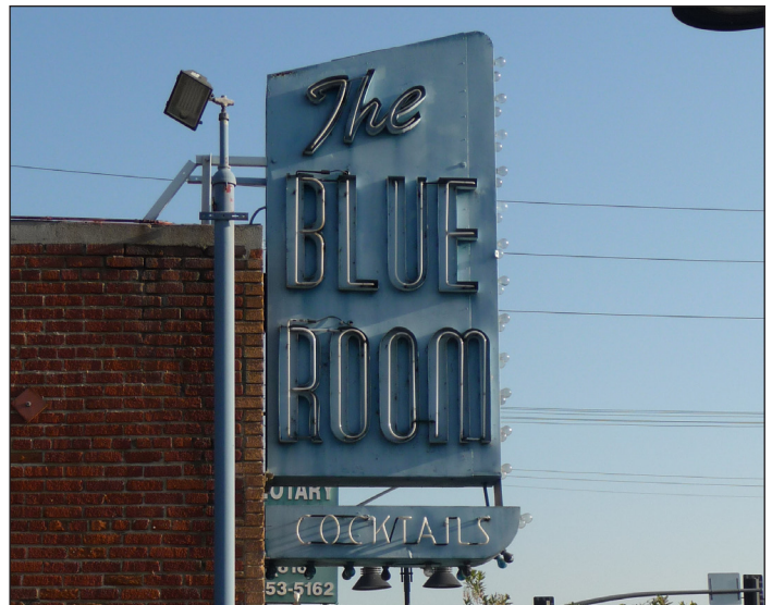
916 S. San Fernando Blvd.