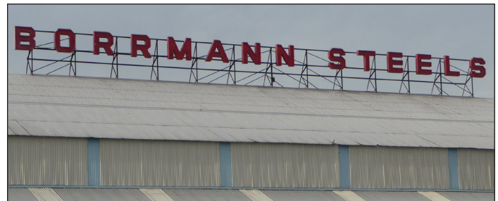
110 W. Olive Ave.