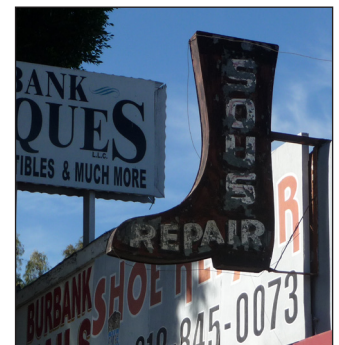
3427 W. Magnolia Blvd.