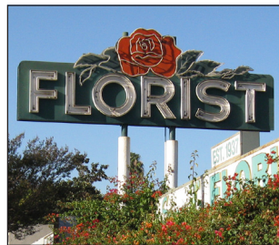
921 W. Olive Ave.