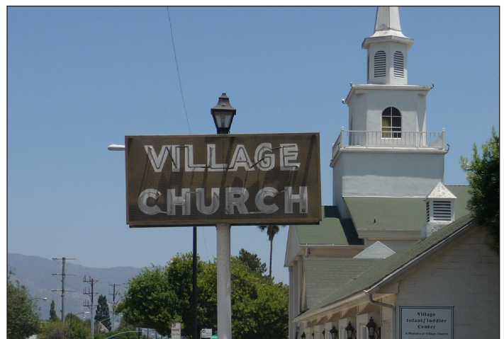
3216 W.Victory Blvd.