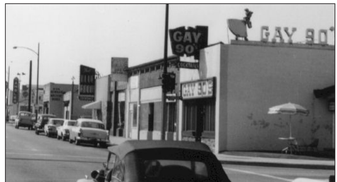
Figure 2. Signs near the intersection of Alameda Avenue and San Fernando Road, ca. 1950s. The Blue Room sign, still extant today, is visible in the background