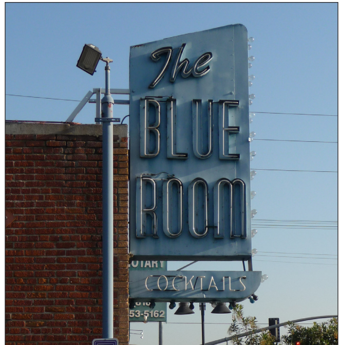
Figure 4. Example of a "Tier 1" sign, which is virtually unchanged. The Blue Room is located at 916 South San Fernando Boulevard. (ARG, 2013)

These signs also predate 1969, but have experienced more extensive alterations that have impacted their historical significance (for example, all neon lettering has been replaced; or all internally illuminated plastic boxes have been removed or replaced). Despite having been altered, these signs are still evocative of Burbank's history and retain aesthetic value.