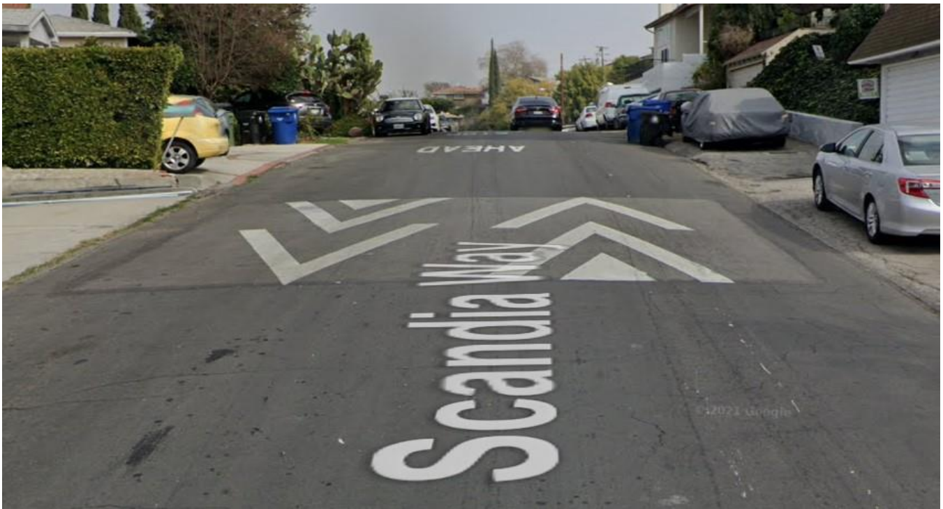
Scandia Wy (Los Angeles)