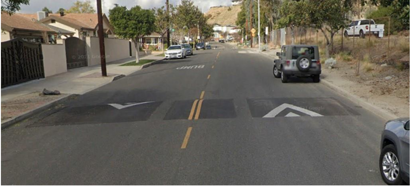
Bel Aire Dr.