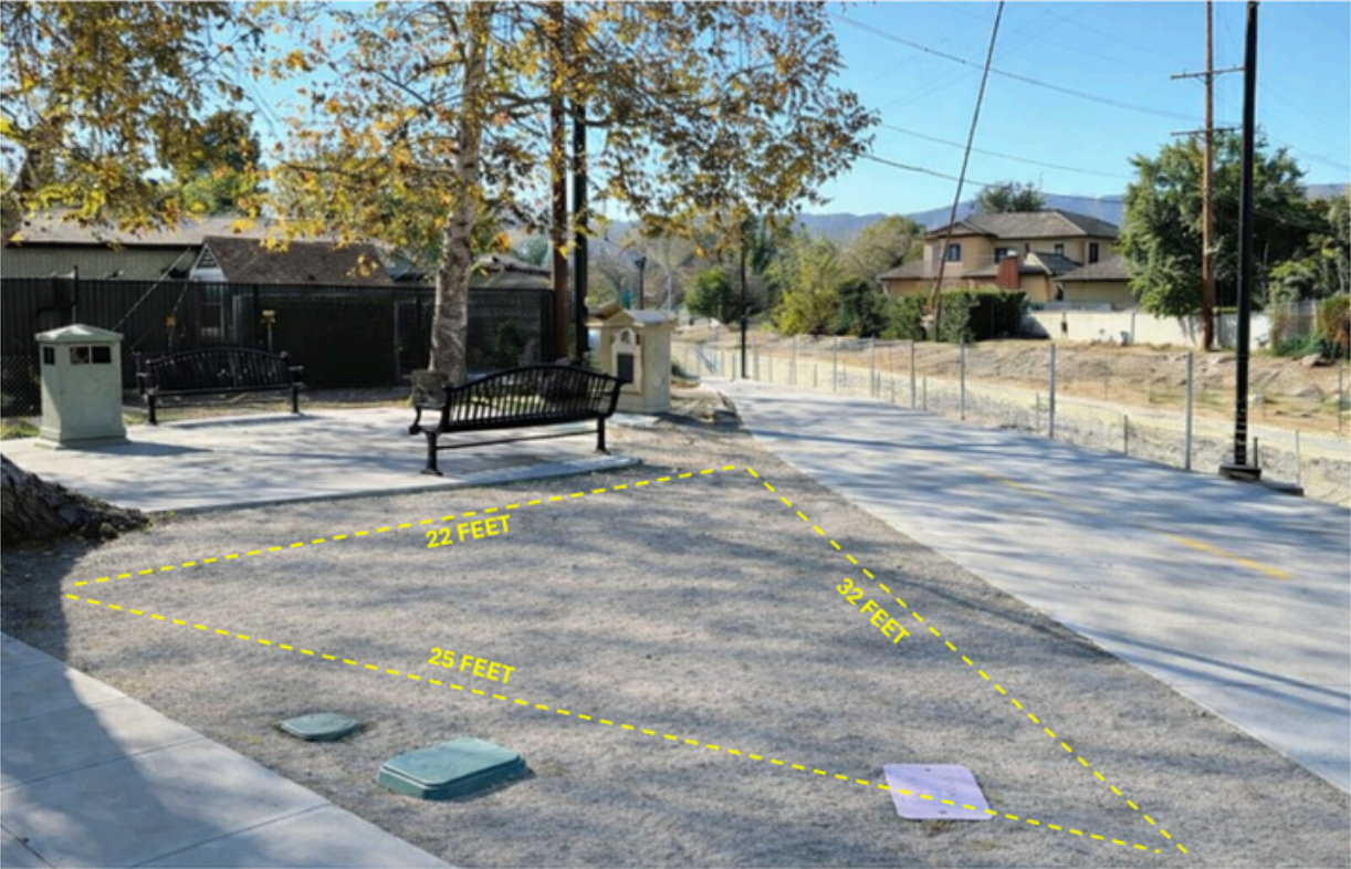
Exhibit A | Site Location